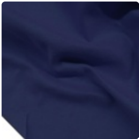
Navy Blue #100012