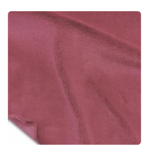
American Ash Rose #100034