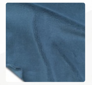
Copen Blue #100043