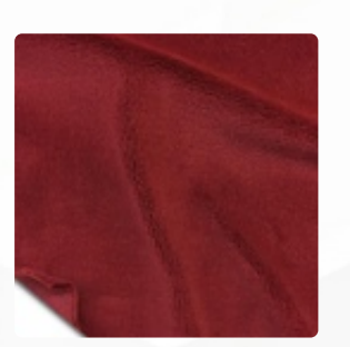
Colonial Brick #100042