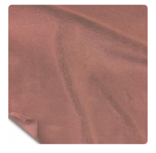
Ash Rose #100068