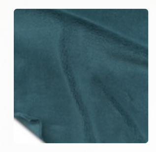
Cadet Blue #100039